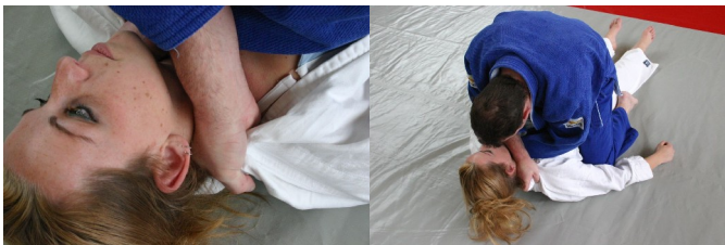
Gyaku juji jime