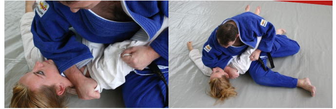
Kata te jime