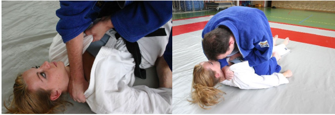
Kata juji jime