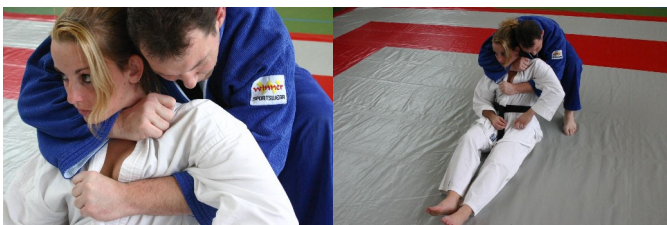
Okuri eri jime