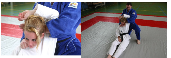
Kata ha jime