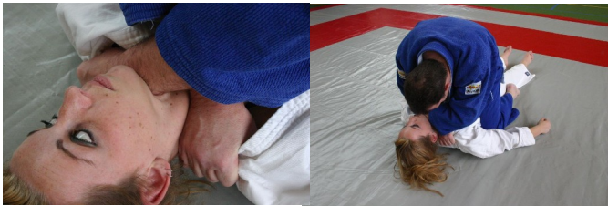
Nami juji jime